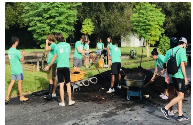
FGCU "Make a Difference Day" Sat., Oct. 23