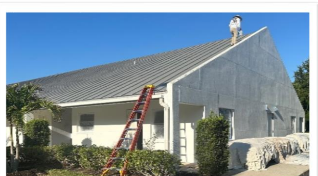
Picture taken on April 26 . The sanctuary will be finished painted by May 3 .

Join us this Tuesday, April 30, from 11am to 12:30pm, in the fellowship hall to connect with other believers who are also coping with grief. Please know this is by no means a professional group counseling session nor intended to replace one’s professional therapist. At Fort Myers Christian Church (Disciples of Christ) I want to simply offer a safe, inviting space for our worshipers as well as our neighbors in the community to share stories, to be a source of encouragement, and to be in prayer with one another. In preacher form, going back to the previous table/backpacking story, I believe as the Body of Christ we can help carry each other’s backpacks full of grief, sorrow, and hurt. We do not have to carry our grief and hurt alone. Depending on the participants and the overall group’s census, this will determine if this ministry will take place once a month or quarterly. Please be sure to sign up in the narthex, this Sunday, as a box lunch will be provided for the first meeting.